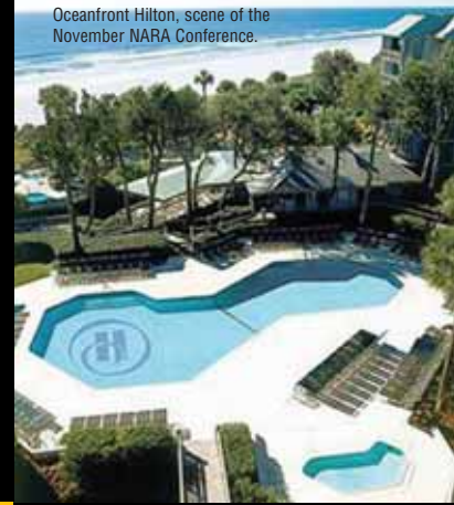
Oceanfront Hilton, scene of the November NARA Conference.

NARA is an eight-year-old national networking and educational organization dedicated to those who build for, serve and market to the burgeoning 50+ market.